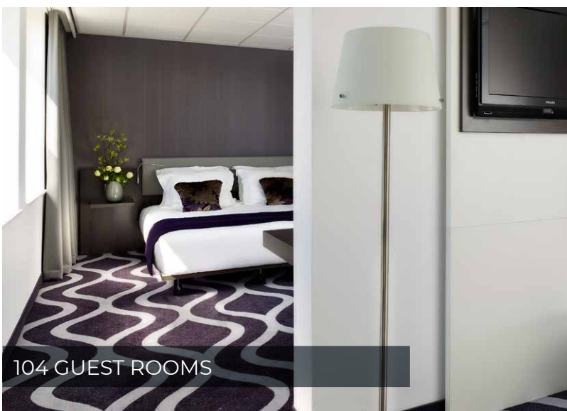
104 GUEST ROOMS