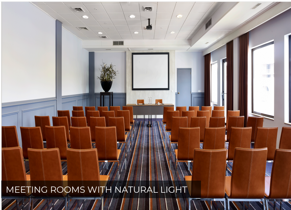
MEETING ROOMS WITH NATURAL LIGHT