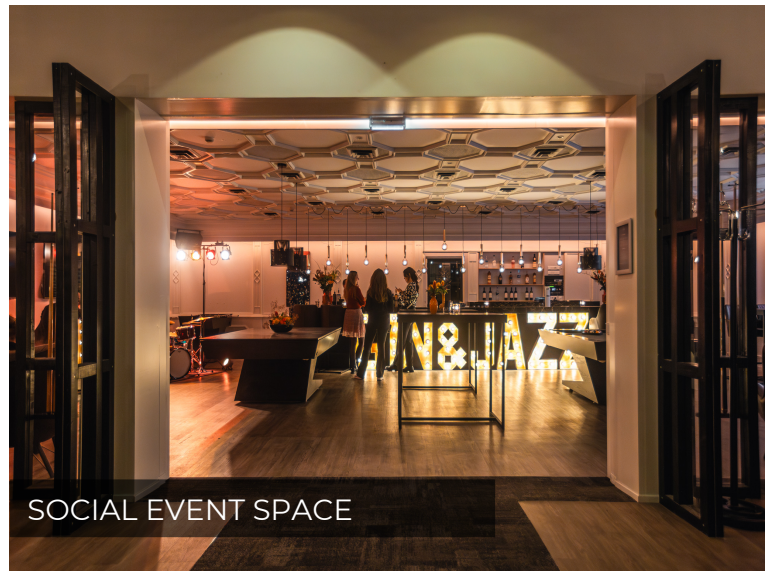
SOCIAL EVENT SPACE