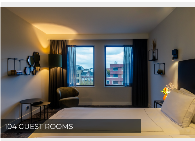
104 GUEST ROOMS